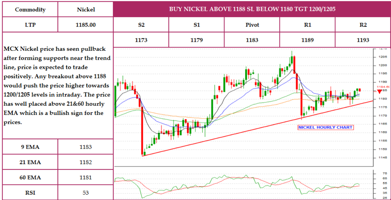
Chart of the days